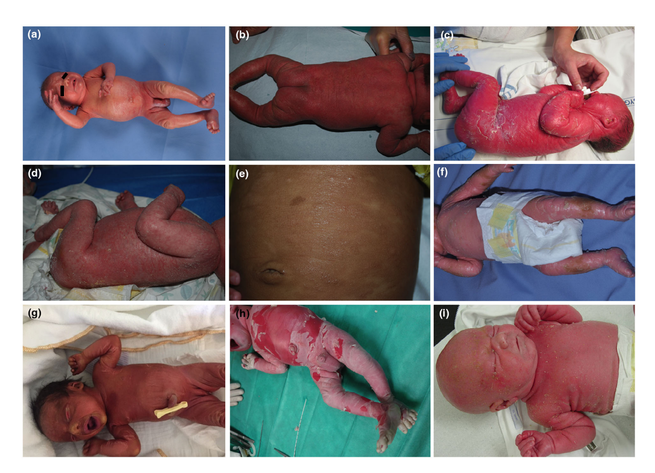
Figure 1 Clinical pictures of patients with neonatal erythroderma. (a) Self-healing collodion baby, (b) Omenn syndrome (courtesy by Iria Neri), (c) Ichthyosis variegata (courtesy by Anette Bygum), (d) Netherton syndrom (courtesy by Iria Neri), (e) diffuse cutaneous mastrocytosis (courtesy by Iria Neri), (f) Harlequin ichthyosis (courtesy by Cristina Has), (g) Ichthyosis NOS, (h) Epidermolytic ichthyosis (courtesy by Cristina Has), (i) Omenn syndrome.

hemidysplasia with ichthyosiform erythroderma and limb defects (CHILD) syndrome has been excluded due to an unilateral erythroderma, and Leiner disease has been excluded because in former cases the disease seemed to be related to NS and Omenn syndrome (OS).<sup>11-13</sup>