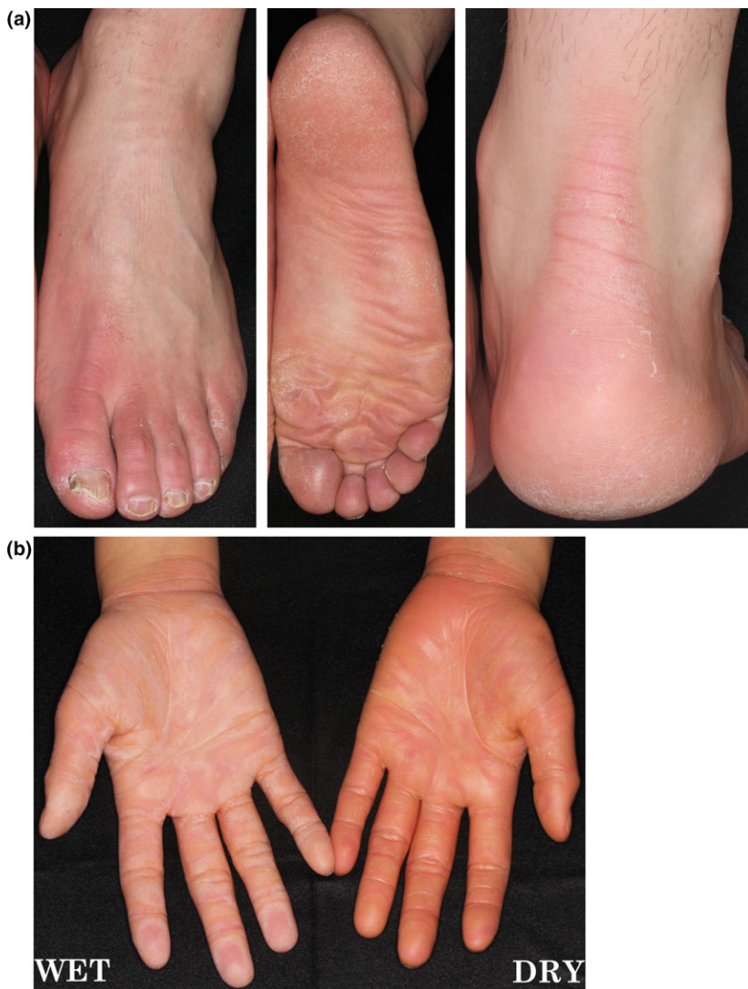
Figure 4. (a) Nagashima palmoplantar keratoderma (PPK) showing mild hyperkeratosis with skin redness and transgrediens. (b) Right hand showing whitish spongy changes after 5 min water exposure.

syndrome is a diffuse PPK associated with ichthyosiform erythroderma in infants, progressive verruciform hyperkeratosis, recurrent infections and increased risk of squamous cell carcinoma. 48 Bart–Pumphrey syndrome shows knuckle pads and leukonychia. 48 Vohwinkel syndrome shows mutilating PPK, characterized by constriction ring formation with alopecia and nail dystrophy. 48 A variant form of Vohwinkel syndrome with ichthyosis (MIM no. 604117) is caused by mutations in LOR , which is sometimes called lorcin keratoderma. 48