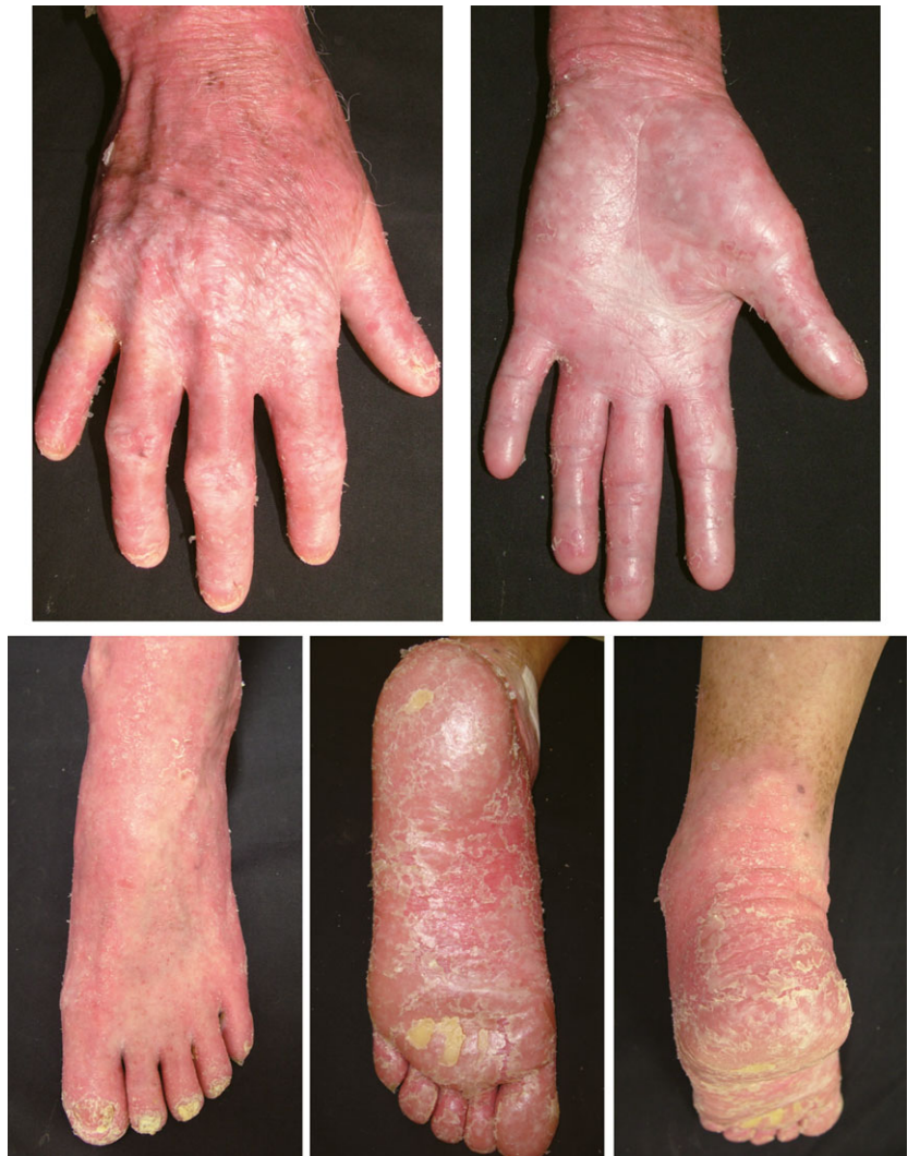
Figure 3. Mal de Meleda showing the most severe hyperkeratosis with transgrediens and leading to flexion contractures. 59

porokeratotic type (MIM no. 175860) and acrokeratoelastoidosis (MIM no. 101850). 41–44 All show autosomal dominant inheritance, whereas the clinical manifestations of each are different and characteristic. Buschke–Fischer–Brauer type PPK shows multiple tiny punctate keratoses on the palms and soles (Fig. 7c). 41,42 It appears during late childhood to adolescence, and the lesions increase in number with advancing age and form larger lesions. Heterozygous mutations in AAGAB , encoding \alpha - and \gamma -adaptin-binding protein p34, and COL14A1 , were identified as causes of Buschke–Fischer–Brauer PPK. 45–47 Porokeratotic-type PPK shows tiny keratotic spines on the palms and soles, beginning during an individual's early 20s, and histological examination reveals columnar parakeratosis. 43 Acrokeratoelastoidosis is characterized by small keratotic papules that primarily involve the margins of the hands and feet, appearing during adolescence or adult life, and histological findings reveal degeneration of elastic fibers. 44 The gene(s) responsible for porokeratotic-type PPK and acrokeratoelastoidosis remain unknown.