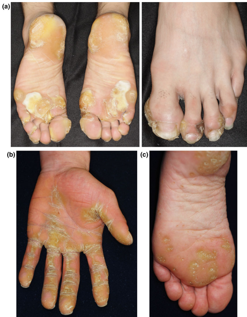
Figure 7. (a) Focal palmoplantar keratoderma (PPK), caused by a KRT6C mutation, showing painful circumscribed hyperkeratosis, such as calluses on the bodyweight-loading area of the soles. 61 (b) Striate PPK, caused by a DSG1 mutation, showing skin thickening, with a prominent linear pattern along the flexor aspects of the fingers. (Photos kindly provided by Dr Toshifumi Nomura.) 62 (c) Buschke-Fischer-Brauer PPK, caused by an AAGAB mutation, showing multiple tiny punctate keratoses on the palms and soles. (Photos kindly provided by Dr Toshifumi Nomura.) 63

tions by clinicians and the development of a network to find rare and undiagnosed PPK patients will become even more important.