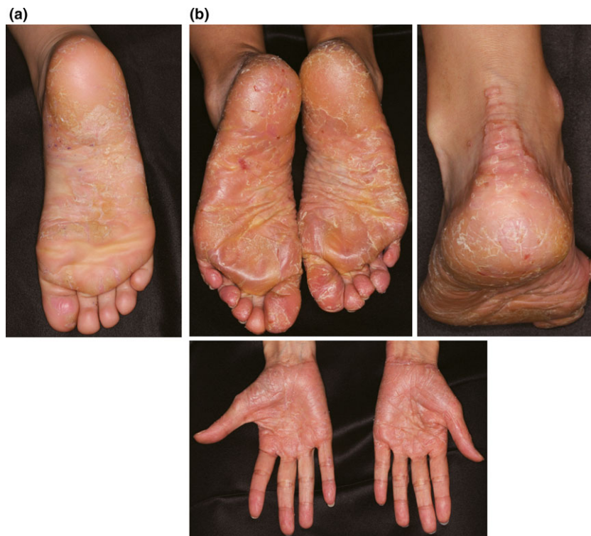
Figure 1. Acquired palmoplantar keratoderma (PPK) (a) Acquired PPK due to contact dermatitis. (b) Acquired PPK due to psoriasis vulgaris.

autosomal dominant traits but can be distinguished by histological findings and the responsible genes. Vörner PPK is diffuse PPK (Fig. 2) caused by mutations in KRT1 or KRT9 and histologically shows epidermolytic hyperkeratosis. 2,4–6 Unna–Thost PPK (MIM no. 600962) was recognized as a non-epidermolytic form of diffuse PPK that resembles Vörner PPK clinically. However, Küster et al. 7 investigated the offspring of the original family diagnosed by Unna and Thost and found epidermolytic hyperkeratosis by histology. Genetic testing revealed the p.R162W mutation in KRT9 in the original family evaluated by Unna and Thost and the p.N160I mutation in KRT9 in the original family evaluated by Vörner, and both mutations are located on the coil-1A segment at the beginning of the central rod domain of KRT9 . 5,6 Thus, it seems likely that Unna–Thost PPK and Vörner PPK are the same entity.