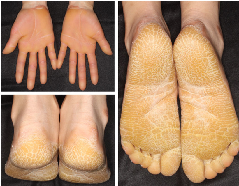
Figure 2. Vörner palmoplantar keratoderma (PPK) showing diffuse hyperkeratosis without transgrediens.