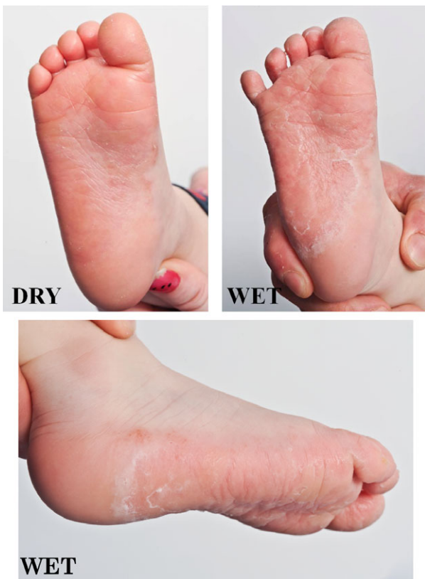
Figure 5. Bothnian palmoplantar keratoderma (PPK) resembles Nagashima PPK in showing mild hyperkeratosis with transgrediens and whitish spongy changes upon water exposure. (Photos kindly provided by Dr John McGrath). 60