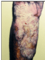
Figure Chromoblastomycosis.